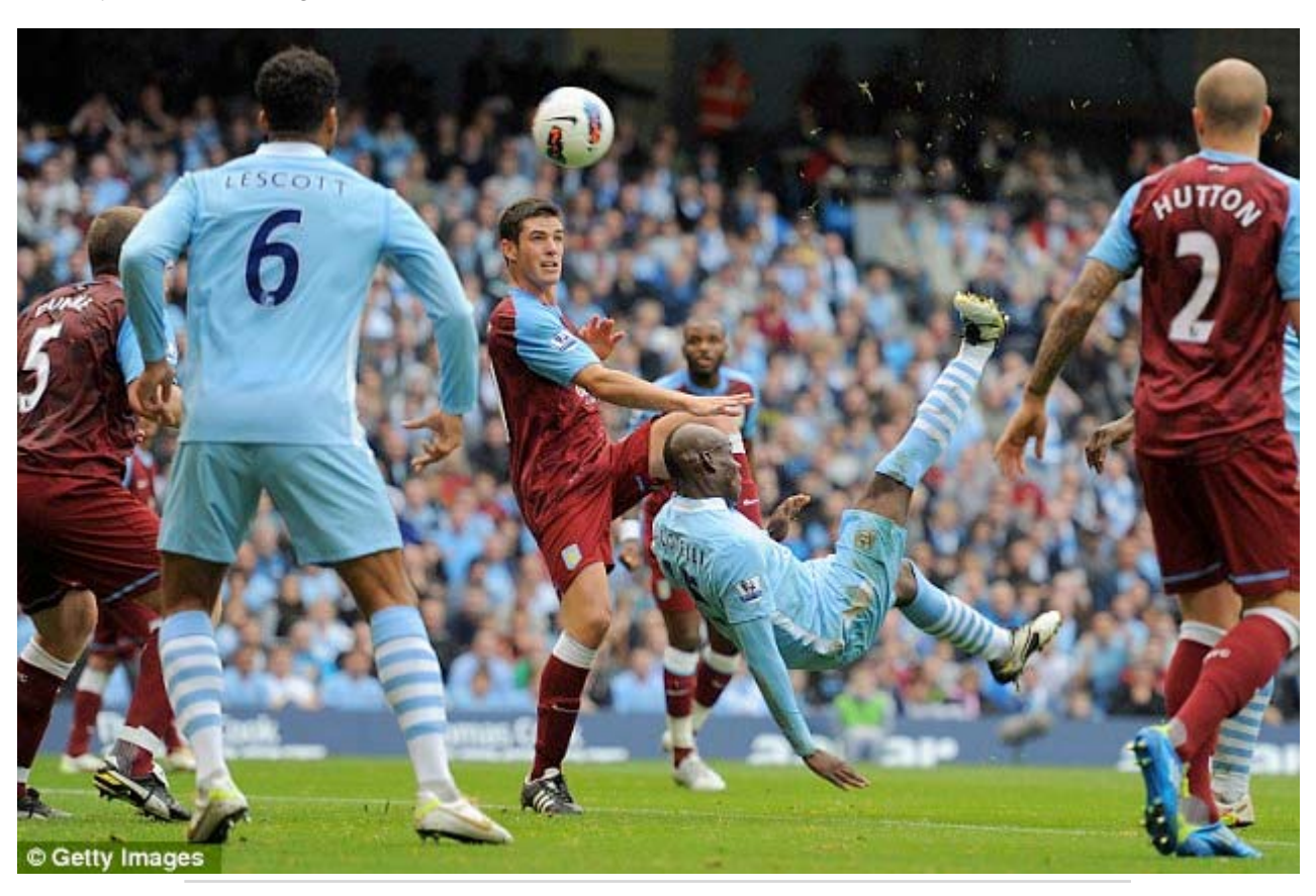
Over and out: Balotelli scored a fine bicycle kick to open the scoring for Man City at Etihad Stadium

The strength in depth that City enjoy took on almost frightening proportions as they reached the Barclays Premier League summit with consummate ease.